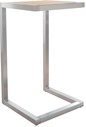
T504SC-H With Wood Top