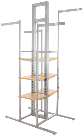
T502SC-H With Maple Wood Shelves