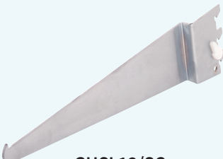
GHSL12/SC 12" Left Offset Shelf Bracket Satin Chrome finish