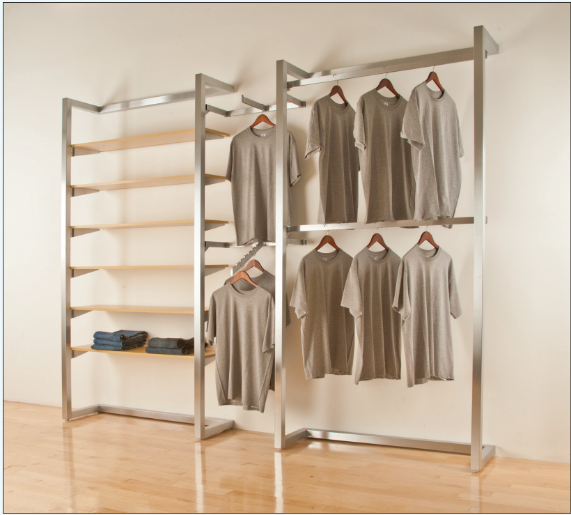
Shown with two T500SC Wall Modules with the following accessories: