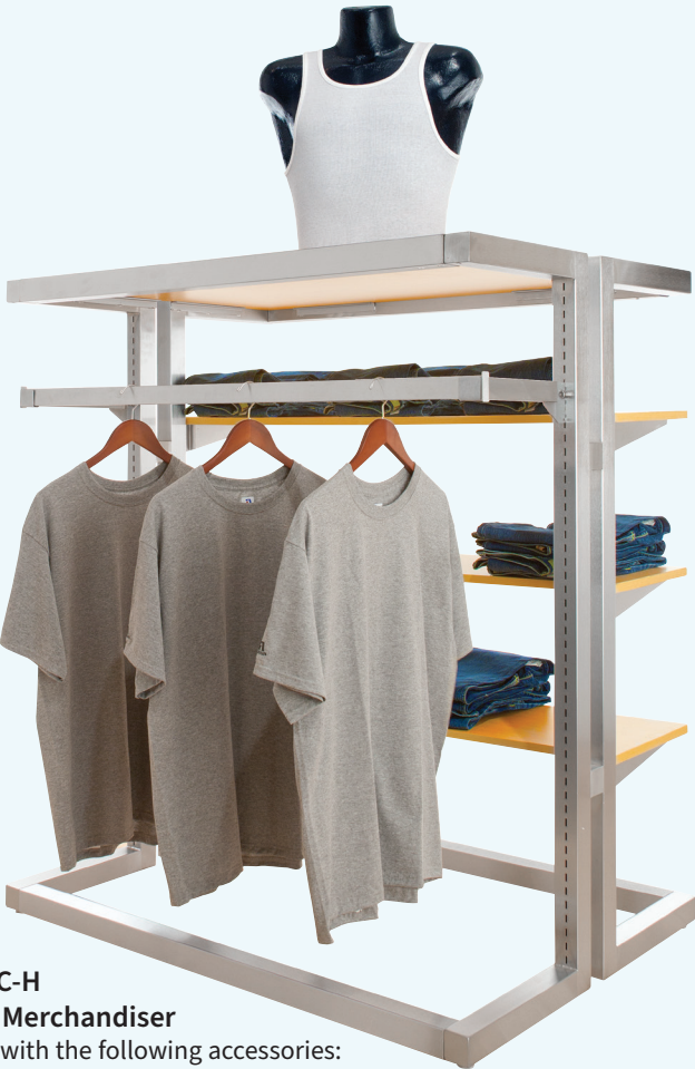
T503SC-H Island Merchandiser Shown with the following accessories: 3) 48" melamine shelves – TSF481H 3) 12" left shelf bracket – GHSL12/SC 3) 12" right shelf bracket – GHSR12/SC 2) 12" hang bar brackets – CR12-SC 1) 4' rectangular tubing – RE4-SC 2) tubing end caps – EC4-SC