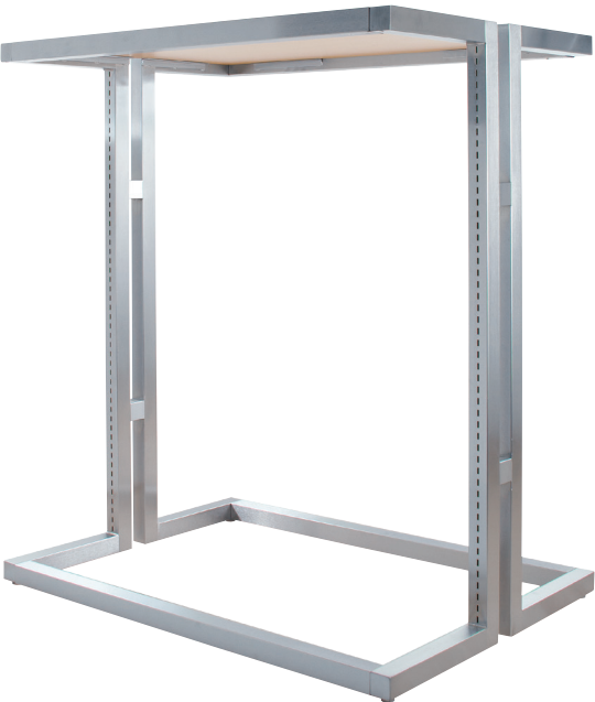
T503SC-H Frame with Wood Top