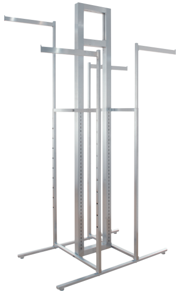
T502FRSC Frame Only