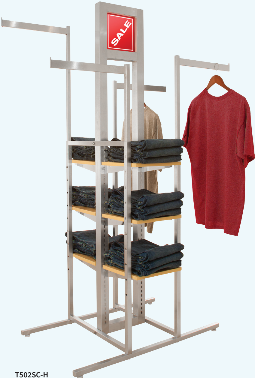
T502SC-H Cross Merchandising 4-Way Rack