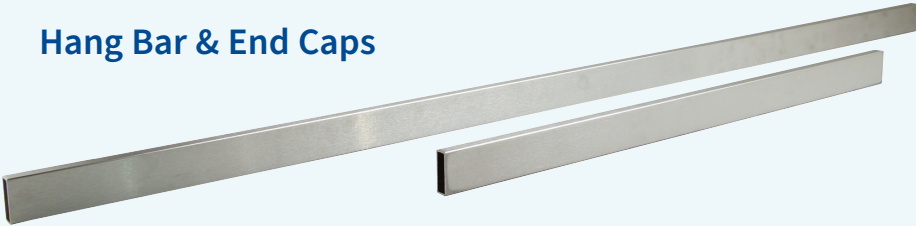
RE4-SC 48" Rectangular 1/2" x 1 1/2" Tubing Satin Chrome finish