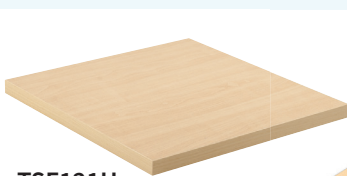
TSF121H 11 3/4" x 12" x 3/4" thick MDF/Melamine in Hard Rock Maple finish For use with T502SC 4-Way Cross Merchandiser Rack Use: 2) GA12 Shelf Brackets per shelf.