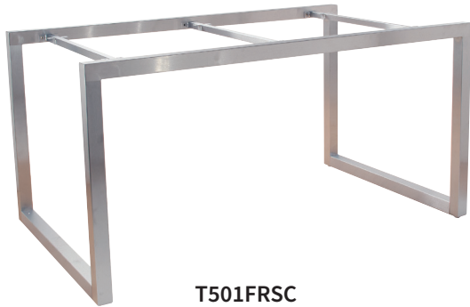
T501FRSC Frame Only