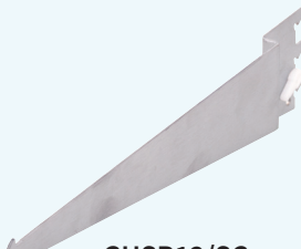
GHSR12/SC 12" Right Offset Shelf Bracket Satin Chrome finish