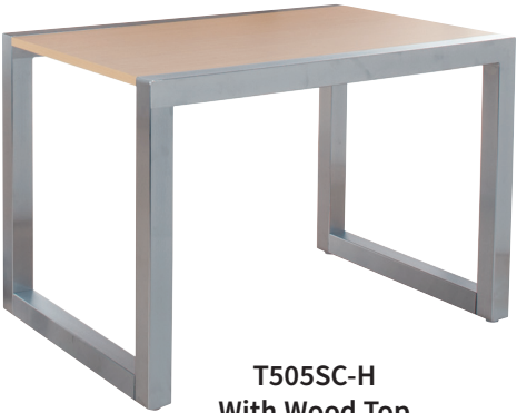
T505SC-H With Wood Top