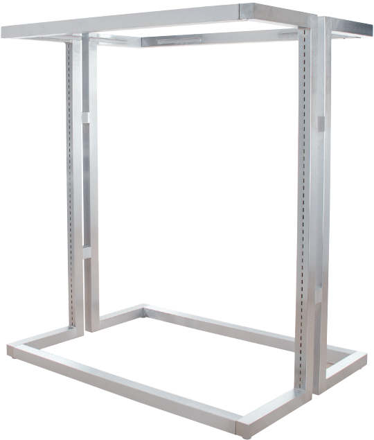
T503FRSC Frame Only