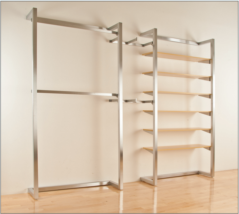
There are a variety of setup options with the Alta Wall Modules for folded and hanging apparel