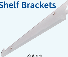
GA12 12" Tap-In Shelf Bracket Chrome finish