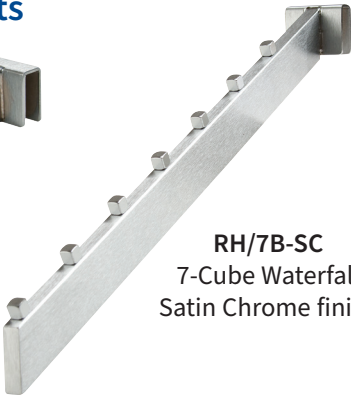
RH/7B-SC 7-Cube Waterfall Satin Chrome finish