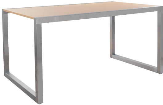
T501SC-H With Wood Top