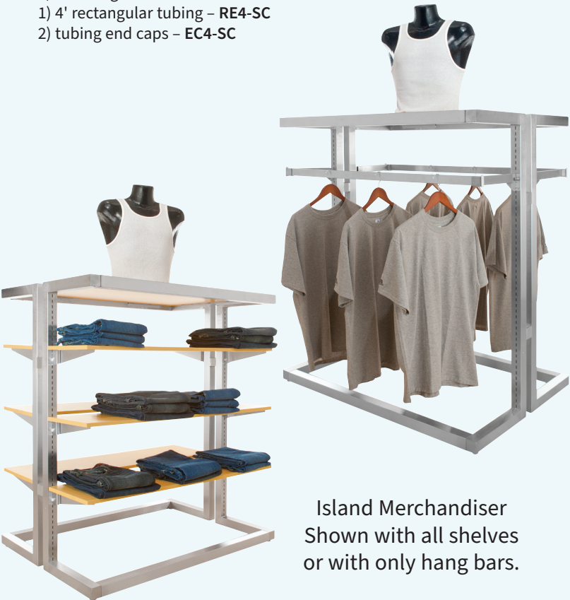
Island Merchandiser Shown with all shelves or with only hang bars.