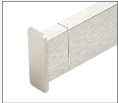
EC5-SC End Cap with 1" extension Satin Chrome finish