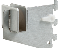
CR3-SC 3" Bracket Satin Chrome finish