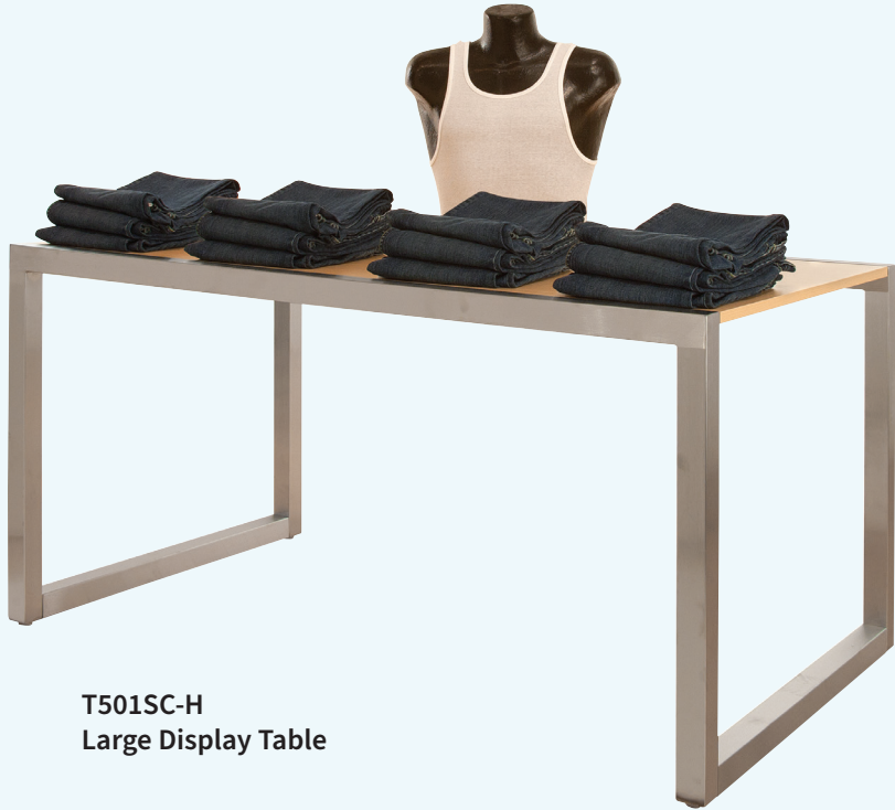
T501SC-H Large Display Table