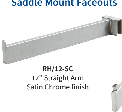
RH/12-SC 12" Straight Arm Satin Chrome finish