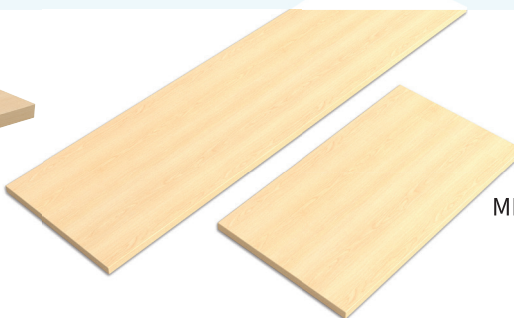
TSF481H - 13" x 48" x 3/4" thick TSF1324H - 13" x 24" x 3/4" thick MDF/Melamine in Hard Rock Maple finish For use with T500SC Wall Module Use: 1) GHSR12/SC Shelf Bracket 1) GHSL12/SC Shelf Bracket per shelf.