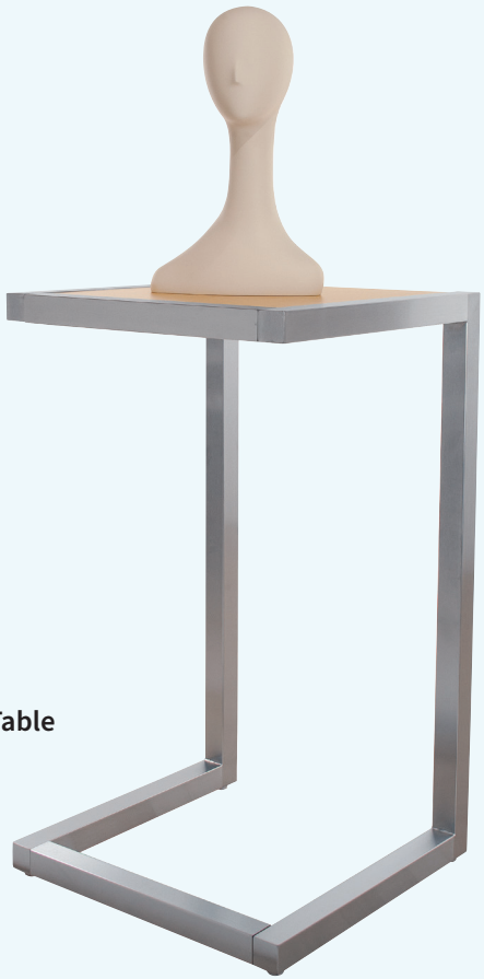
T504SC-H Pedestal Table