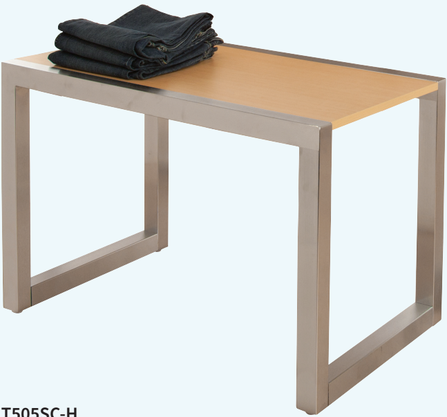
T505SC-H Medium Display Table