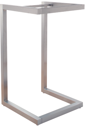
T504FRSC Frame Only