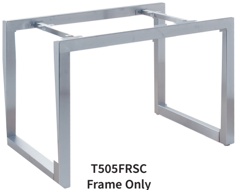
T505FRSC Frame Only