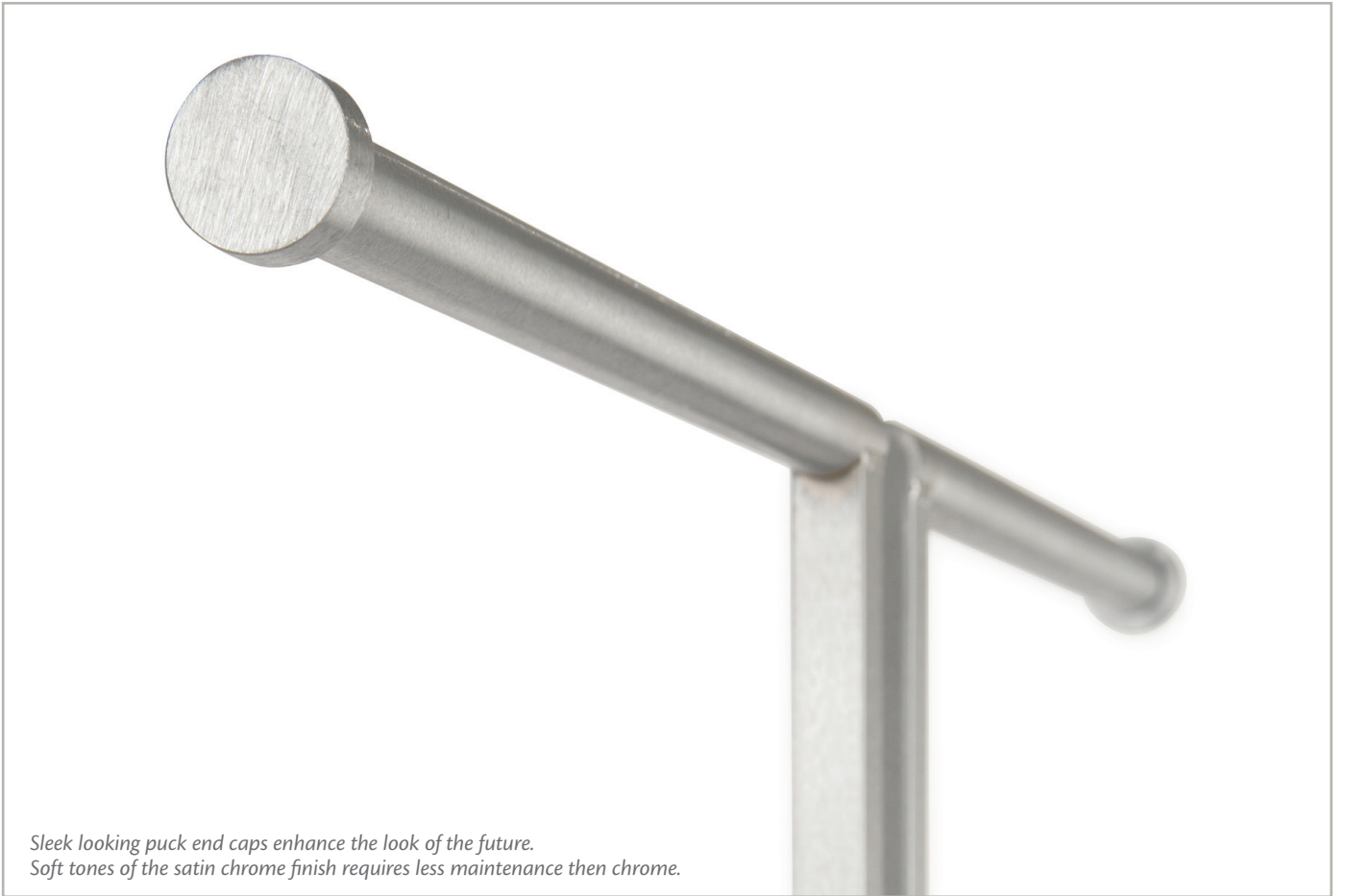
Sleek looking puck end caps enhance the look of the future. Soft tones of the satin chrome finish requires less maintenance than chrome.