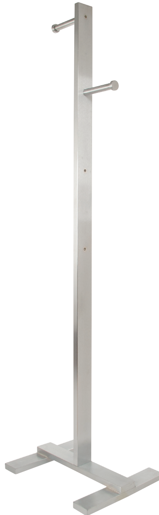
Adjustable Costumer BA46SC

74" high, Upright is 1" x 3" tubing 6" long x 1" dia. faceouts with puck ends that adjust to 36", 48", 60" & 72". Levelers included. Satin chrome finish.