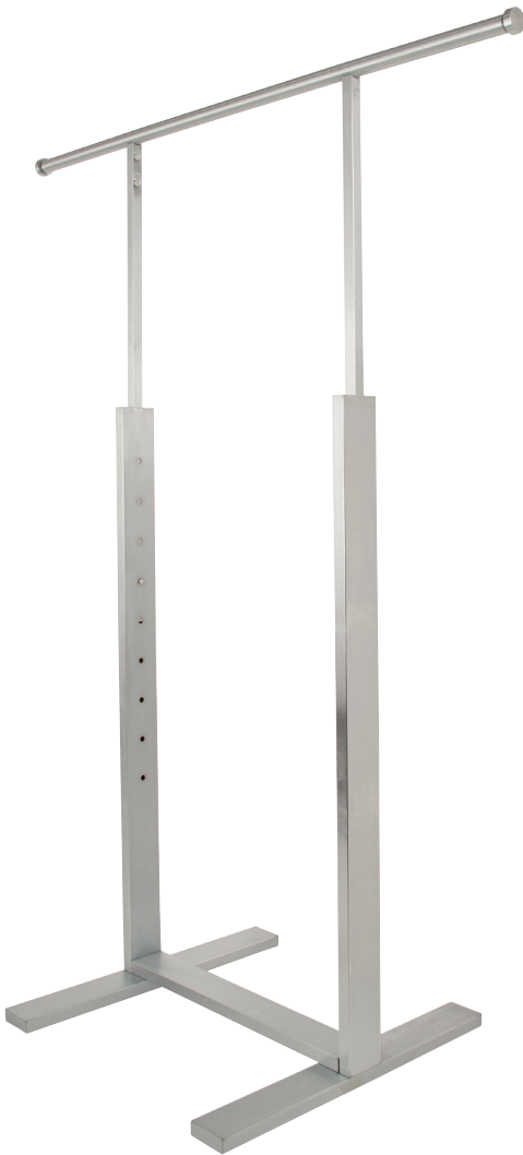
Adjustable Single Bar Merchandiser BA45SC

Frame height adjusts 48" min to 72" max. Uprights are 1" x 3" tubing. Hangrail is 1 1/4" dia. x 48" long with puck ends. Base is 24" x 24". Levelers included. Satin chrome finish.