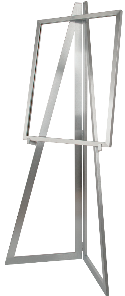
Folding Easel BH80SC

Frame holds 22" x 28" sign. Easel is 1/2" x 1 1/2" tubing. Overall height is 60"H. Legs are 18"W each. Satin chrome finish.