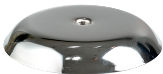
item: 10B 10" diameter base with 7/8" fitting.