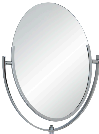
Oval Double-Sided Tilting Mirror

Works with any Square, Parsons or Trumpet Style Chrome Bases.