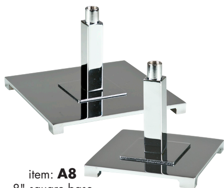
item: A8 8" square base with 5/8" fitting.