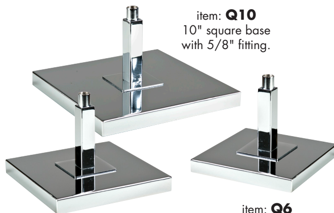
item: Q10 10" square base with 5/8" fitting.