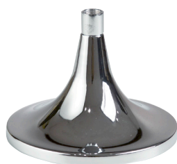
item: R6 6" Diameter base with 5/8" fitting.