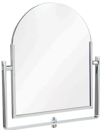
Double-Sided Tilting Mirror