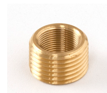
item: RA7858 7/8" to 5/8" reducing adapter For use with 10B base & 5U, 6U, 7U & 9U uprights with 5/8" fitting.