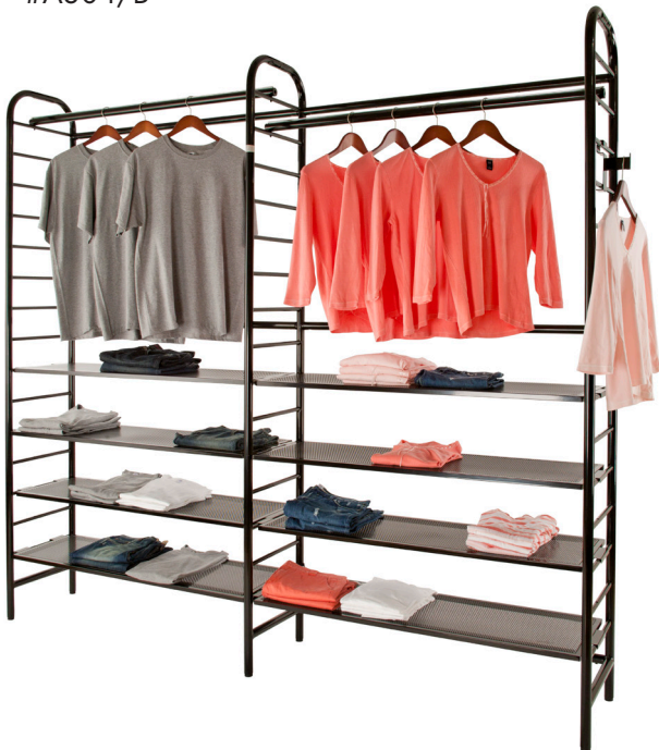
Double Two-Tier Wall Unit shown with eight Interior Shelves (# AT77/B) and one 3" Face-out (# AF3/B)