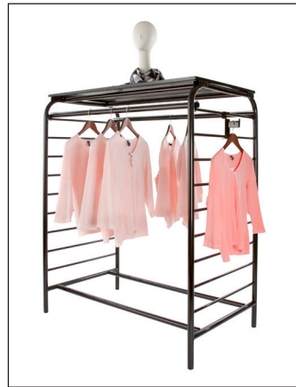
Double Center Floor Rack shown with Top Shelf (sku: AT66/B)

Tubular base: 18"W x 22"D x 1-1/4" diameter tubing Upright measures: 73"H x 14"W Black epoxy finish. # A306/B