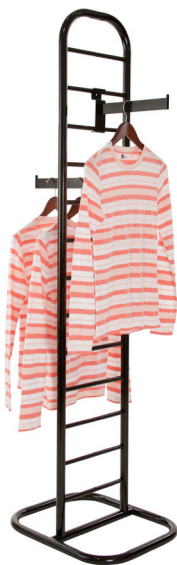
Tower Ladder shown with two 12" Face-Outs (# AF12/B)

48"W x 28"D x 58"H. Black epoxy finish. Includes two 1.25" dia. hangrails with protective chrome wire. Support rails securely bolt unit together. 5/16" levelers included, accepts casters. # A301/B