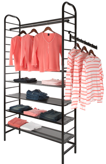
Single Two-Tier Wall Unit shown with four Interior Shelves (# AT77/B) and one Waterfall (# AF7/B)