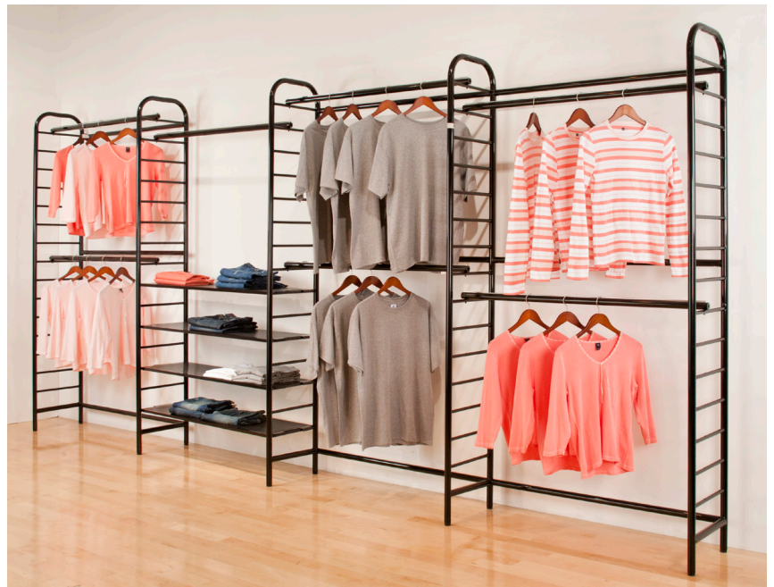
Double Two-Tier Wall Unit & Single Two-Tier Wall Unit connected with optional Hangbar (ARL48/B) and four Interior Shelves (AT77/B)