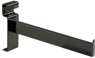
12" Faceout Black epoxy finish. sku: AF12/B