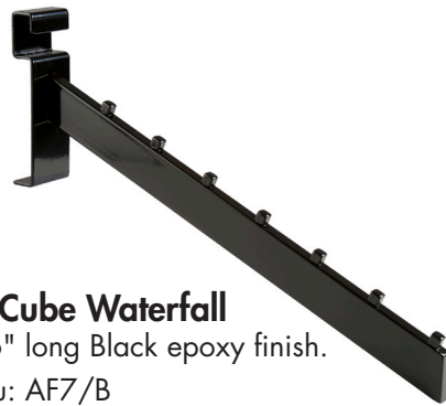
7-Cube Waterfall 16" long Black epoxy finish. sku: AF7/B