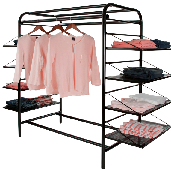
Double Center Floor Rack shown with eight End Shelves (# AT87/B)