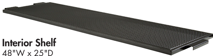
Interior Shelf 48"W x 25"D Fits all Ladder System Racks. Black epoxy finish. sku: ATT77/B