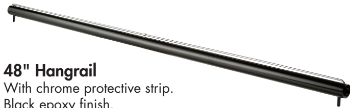
48" Hangrail With chrome protective strip. Black epoxy finish. sku: ARL48/B