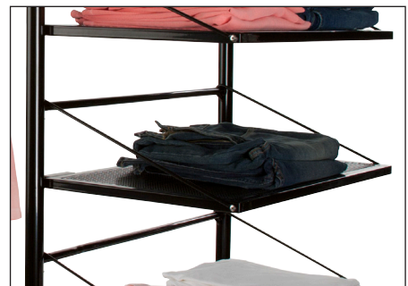
End Shelf on A301/B