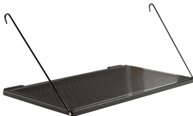
End Shelf for A301/B 48"W x 25"D Fits all Ladder System Racks. Black epoxy finish. sku: ATT87/B