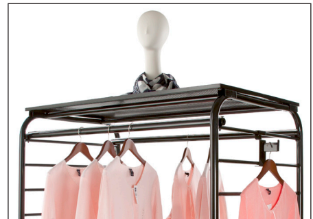
Top Shelf on A301/B

4" dia. wheel with 1"L x 5/16" Stem. Load capacity 750 lbs per set of 4 sku: ACT4