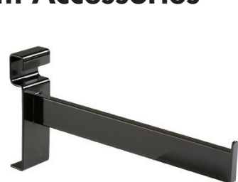
12" Faceout Black epoxy finish. sku: AF12/B