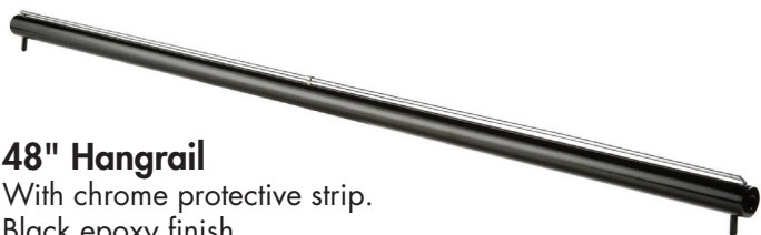
48" Hangrail With chrome protective strip. Black epoxy finish. sku: ARL48/B