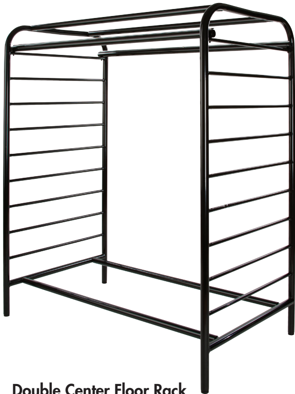
Double Center Floor Rack 48"W x 28"D x 58"H. Black epoxy finish. Includes two 1.25" dia. hangrails with protective chrome wire. Support rails securely bolt unit together. 5/16" levelers included, accepts casters. # A301/B