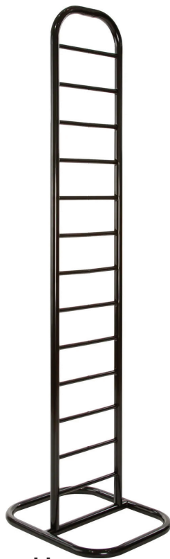
Tower Ladders Tubular base: 18"W x 22"D x 1-1/4" diameter tubing Upright measures: 73"H x 14"W Black epoxy finish. # A306/B

The Ladder System™ from Econoco. A timeless and affordable, simple-to-install system that adds functionality and style to any retail environment.