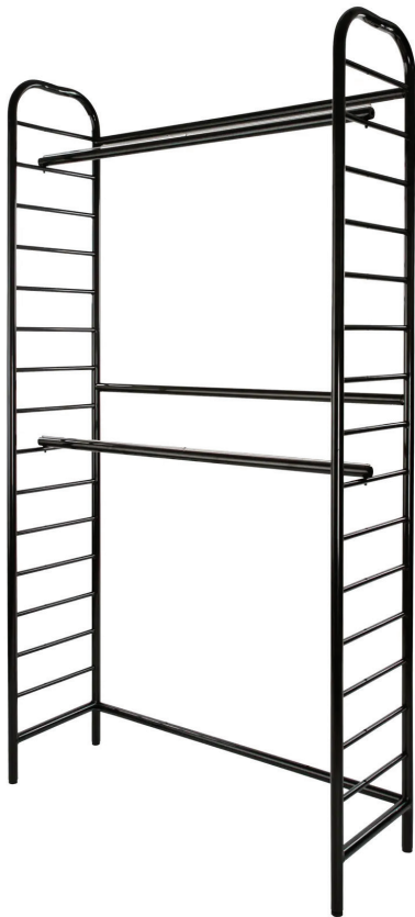
Single Two-Tier Wall Unit 48"W x 16"D x 88"H. Black epoxy finish. Includes two 1.25" dia. hangrails with protective chrome wire. Back support rails securely bolt unit together. 5/16" levelers included. #A304/B