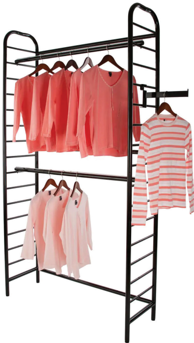
Single Two-Tier Wall Unit shown with four Interior Shelves (# AT77/B) and one Waterfall (# AF7/B)