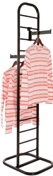
Tower Ladder shown with two 12" Face-Outs (# AF12/B)