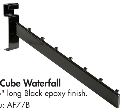
7-Cube Waterfall 16" long Black epoxy finish. sku: AF7/B