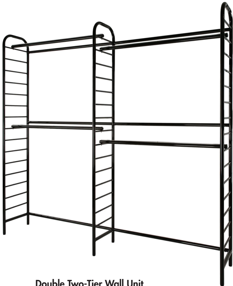
Double Two-Tier Wall Unit 96"W x 16"D x 88"H. Black epoxy finish. Includes four 1.25" dia. hangrails with protective chrome wire. Back support rails securely bolt unit together. 5/16" levelers included. # A305/B