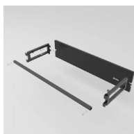
DDKIT1PP Front Privacy Panel for DDKIT1