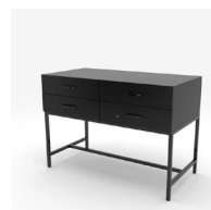
DDKIT2 Deluxe Display Table w/ Storage Drawers