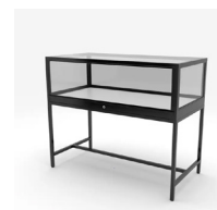
DDKIT3 Deluxe Glass Showcase Display Cabinet