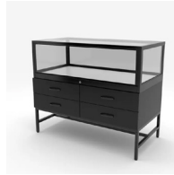
DDKIT1B Black Metal Showcase w/ Black Storage Cabinet