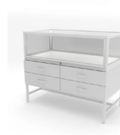
DDKIT1W White Metal Showcase w/ White Storage Cabinet