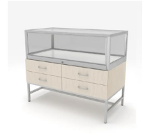
DDKIT1SC Satin Chrome Showcase w/ Wood Storage Cabinet